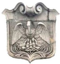
Pelican Center for Children & Families

The LBF Education Committee produces a continuing series of oral histories. The series is a part of the Committee's plans to systematically broaden the LBF's work to preserve the history, culture and flavor of Louisiana Law.