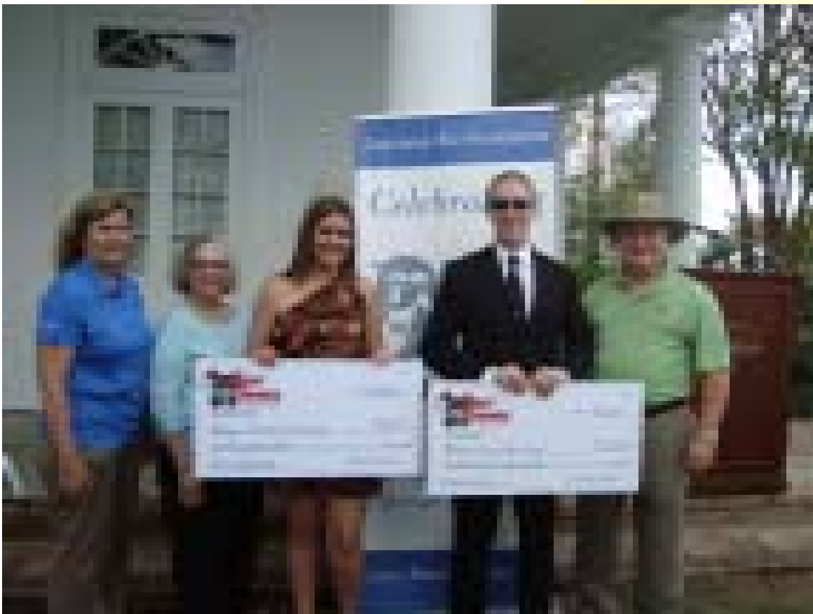
Mock scholarship checks presented at golf tournament