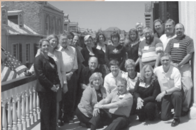
Kids' Chance Conference participants.

In April, the LBF hosted the 3 rd National Kids' Chance Conference in New Orleans, at the historic Bourbon Orleans hotel in the French Quarter. The conference was originally scheduled in early February, to coincide with the American Bar Association convention. After Hurricanes Katrina and Rita crippled the ability of New Orleans to host large conventions, the LBF rescheduled the conference in an effort to boost tourism and welcome visitors back to the city.