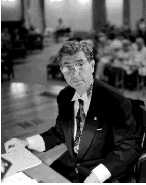
Old State Capitol.