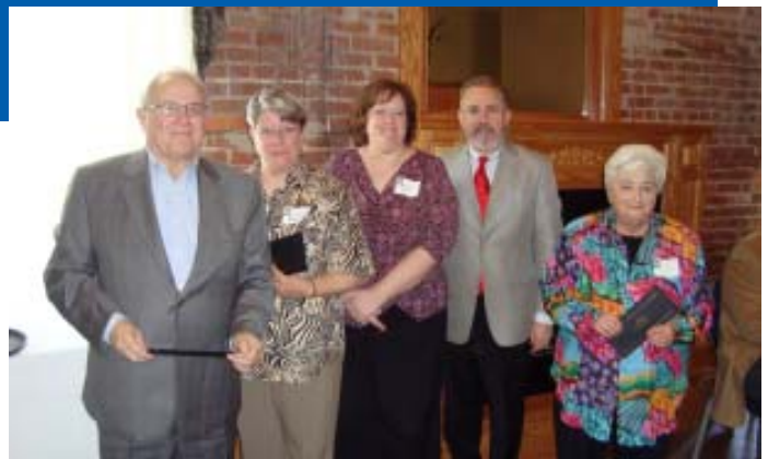
Southwest Area Grantees