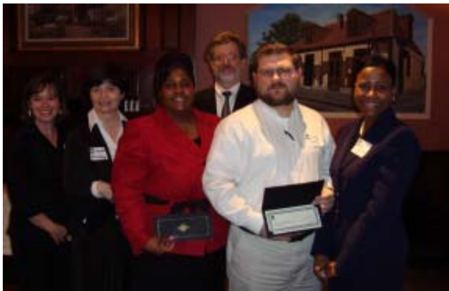
Northeast Area Grantees